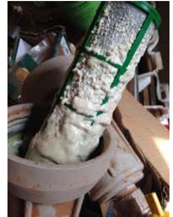
Can this mess be avoided?