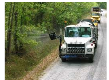
What is the fate of roadside applied herbicides?